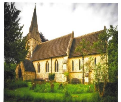
St. John the Evangelist, Whitfield