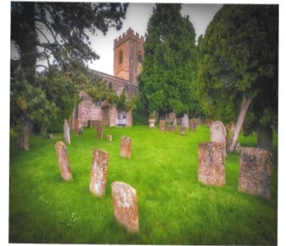
St Mary & St. Peter, Lois Weeden & Weston with Plumpton