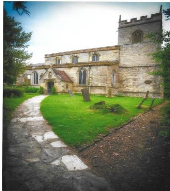
St. Mary Magdalene, Helmdon &