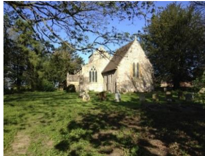
St. Lawrence, Chapel of Ease, Radstone