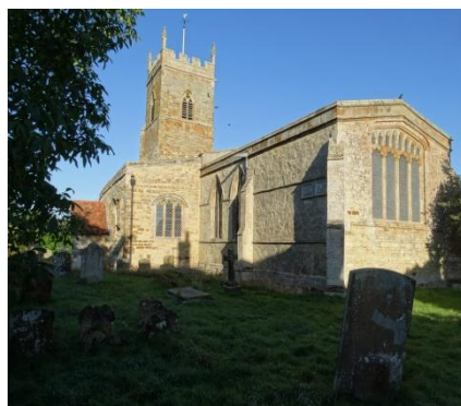
St. Mary the Virgin, Wappenham