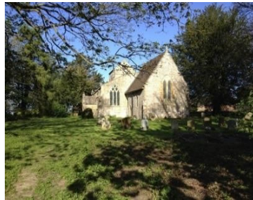
St. Lawrence, Chapel of Ease, Radstone