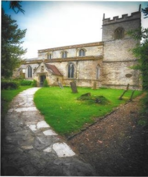
St. Mary Magdalene, Helmdon