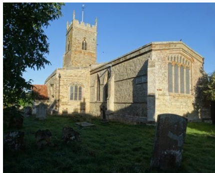
St. Mary the Virgin, Wappenham