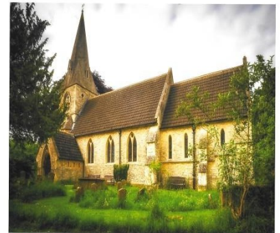
St. John the Evangelist, Whitfield