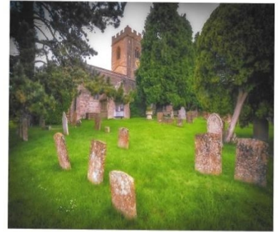
St Mary & St. Peter, Lois Weeden & Weston with Plumpton